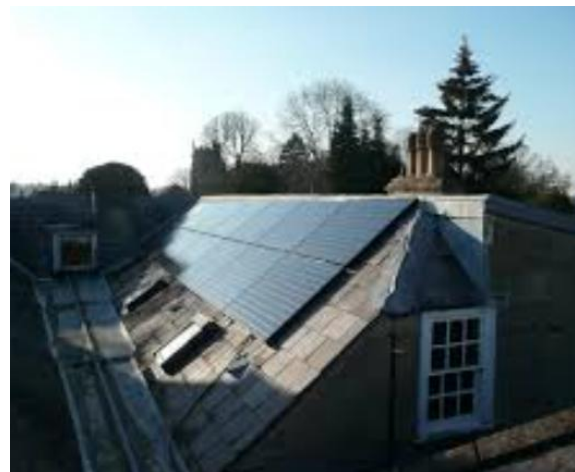
Southerly Facing Solar Panels inside the pitched-roofs of Listed Buildings.

Go Green Widcombe also keeps a regular check on the number of Listed Building Applications for certain projects, including Solar Panels. Using the " Keyword " search option mentioned earlier, Go Green Widcombe have uncovered 96 separate Listed Building